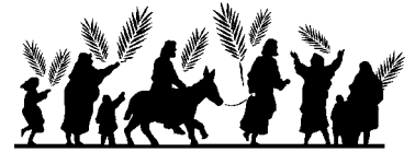
Procession of the Palms

PALM SUNDAY, April 17, 8:30 & 11:00 a.m. services, SCS 9:45 a.m. During the pre-liturgy, we will have the Blessing of the Palms that help us recall our Lord's triumphant entry into Jerusalem to the shouts of "Hosanna." We will remember the passion of Holy Week according to the reading of St. Luke.